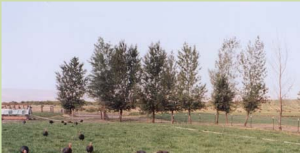
PCC Farmland Trust organic farm, Walla Walla.

Congratulations to PCC Farmland Trust. This is a true example of the ripple effect of WWF's high-impact funding!